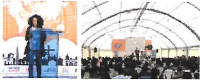
Student National Leadership Conference at Debrezeit, Ethiopia, Aug. 2019