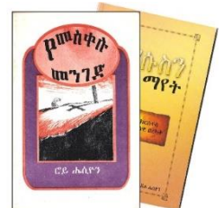
'Calvary Road' and 'We Would See Jesus'